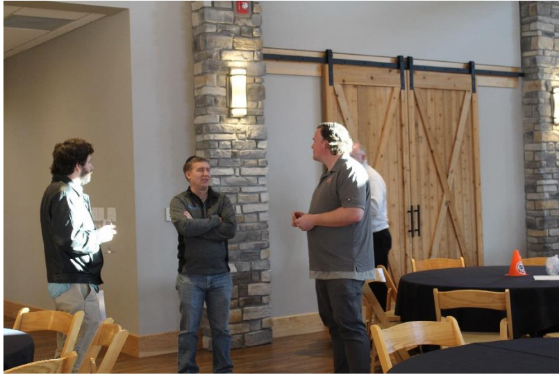
Socializing at the 2022 Banquet