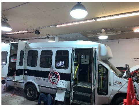
Clean up on the van. It is ready for the Solo season