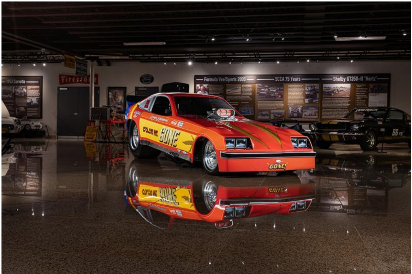
This is a picture from the Museum of American Speed in Lincoln, NE. A large SCCA display is in the background